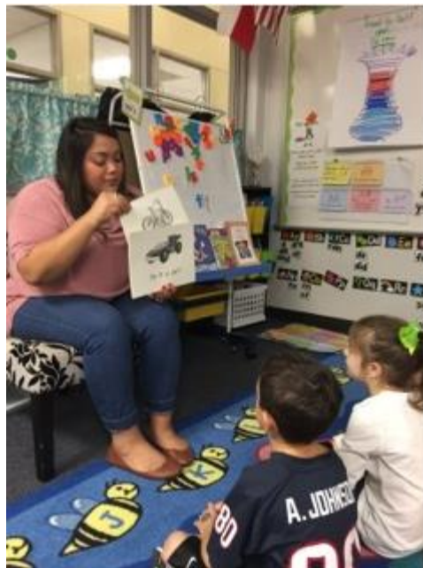
Reader's Workshop Minilesson