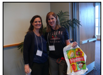
Reading Teachers enjoying the Literacy Summit at the University of the Incarnate Word in San Antonio.

Visit the IRA's website at www.reading.org